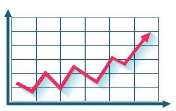
According to Statista a business data platform, by 2023 the e-commerce market size will become USD 3 billion in Bangladesh (BDT 25,200 cr.).